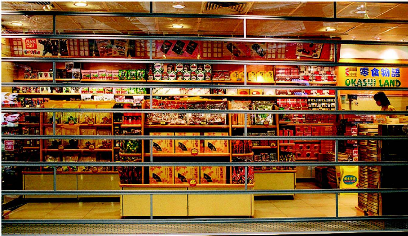
A snack store with a Superfine TPS5 transparent roller shutter located in Hong Kong International Airport.